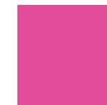
PANTONE 232 C C 5 R 239 M 86 G 63 Y 0 B 169 K 0 EF3FA9