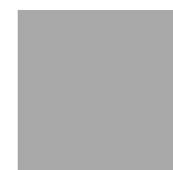
PANTONE COOL GRAY 6 C C 35 R 169 M 29 G 168 Y 28 B 169 K 0 A9A8A9