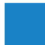
PANTONE PROCESS BLUE C C 100 R 0 M 35 G 129 Y 7 B 201 K 0 0081C9