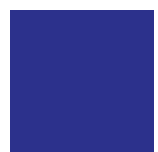
PANTONE BLUE 072 C 100 R 5 M 98 G 13 Y 2 B 158 K 3 050D9E