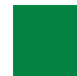
PANTONE 348 C C 97 R 0 M 22 G 131 Y 100 B 61 K 9 00833D