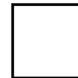
WHITE C 17 R 210 M 14 G 207 Y 15 B 205 K 0 D2CFCD