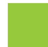
PANTONE 375 C C 46 R 148 M 0 G 213 Y 100 B 0 K 0 94D500