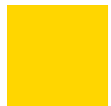
PANTONE YELLOW 012 C C 2 R 255 M 12 G 214 Y 100 B 0 K 0 FFD600