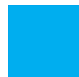
PANTONE PROCESS CYAN C 100 R 0 M 0 G 173 Y 0 B 239 K 0 00ADEF