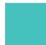
PANTONE 3252 C C 65 R 27 M 0 G 207 Y 29 B 201 K 0 1BCFC9