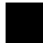
BLACK C 17 R 210 M 14 G 207 Y 15 B 205 K 0 D2CFCD