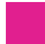
PANTONE RHODAMINE RED C C 5 R 231 M 97 G 0 Y 0 B 148 K 0 E70094