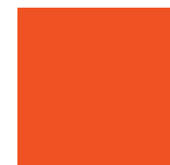
PANTONE ORANGE 021 C C 0 R 255 M 83 G 80 Y 100 B 0 K 0 FF5000