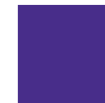
PANTONE VIOLET C C 89 R 67 M 100 G 0 Y 1 B 152 K 2 430098