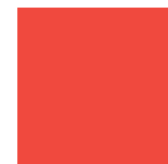
PANTONE WARM RED C C 0 R 255 M 87 G 67 Y 80 B 55 K 0 FF4337